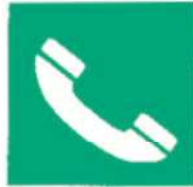
Emergency telephone for first-aid or escape