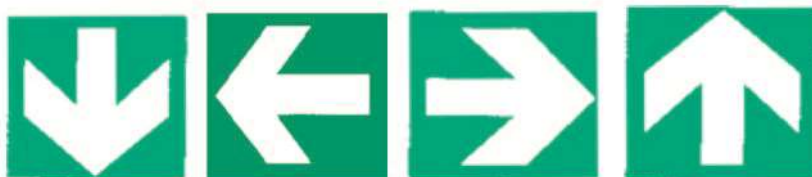
This way (supplementary information signboard)